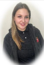
Tullula Key Buddy: Loran