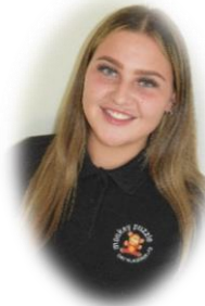
Tullula Key Buddy: Loran

Please see who is going to be your little one's new key worker in February