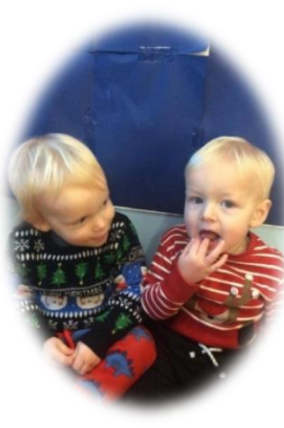
Christmas Jumper day!