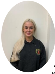
Loran Key Buddy: Tullula