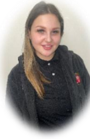
Tullula Key Buddy: Loran